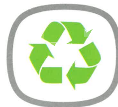
Organic Recycle / Charcoal