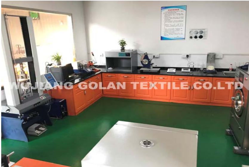
Laboratory & Warehouse & Inspection