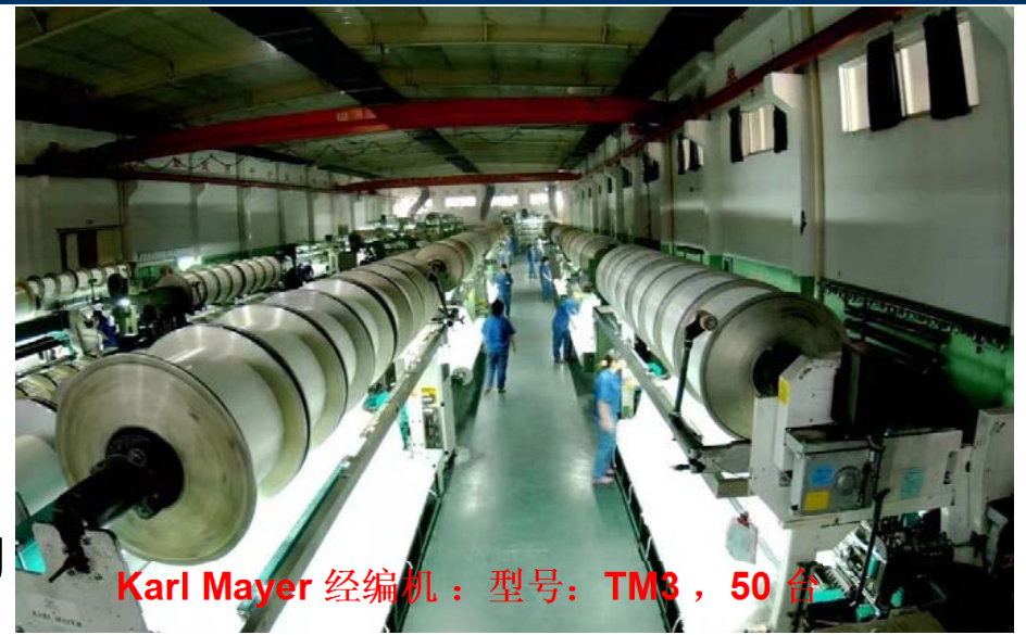
Karl Mayer 经编机：型号：TM3，50 台